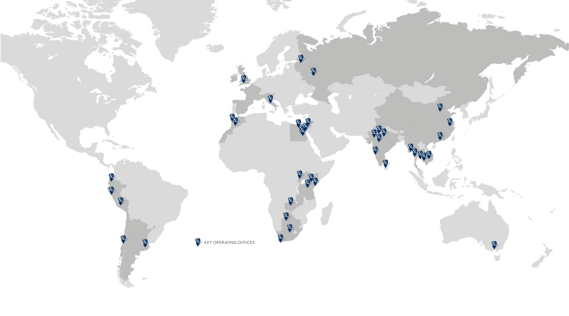
51 offices • 26 countries • 2,300 employees

Argentina • Australia • Botswana • Cambodia • Chile • China • Ecuador Egypt • Europe • Hong Kong • India • Italy Jordan • Kenya • Morocco • Myanmar • Peru • Russia • South Africa • Sri Lanka • Tanzania • Thailand • Uganda • United Kingdom • Vietnam • Zambia